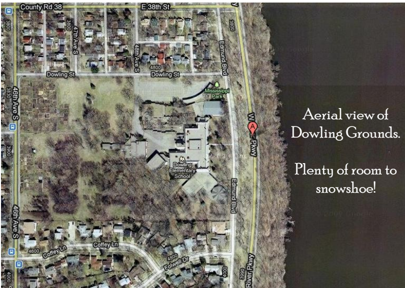
Aerial view of Dowling Grounds. Plenty of room to snowshoe!

As of 2017 at least four classrooms may snowshoe or inline skate at the same time, and at least two classes may go cross country skiing. Dowling now shares their fleet of equipment with other Minneapolis schools, expanding the impact of our support. Plenty of tents, sleeping bags, cameras, snow saucers, adaptive sleds and winter apparel and boots for children that don't have the means to stay warm in a Minnesota winter. Our current support goes to their general fund.