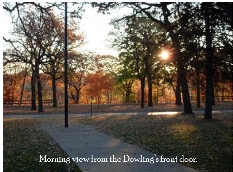
Morning view from the Dowling's front door.